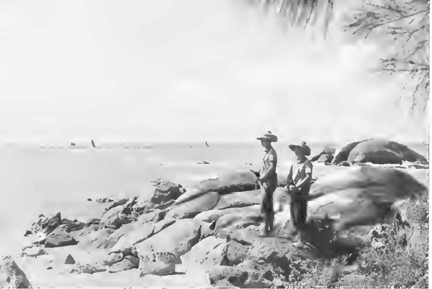
People's militiamen on patrol on the shore of Peipu Gulf.